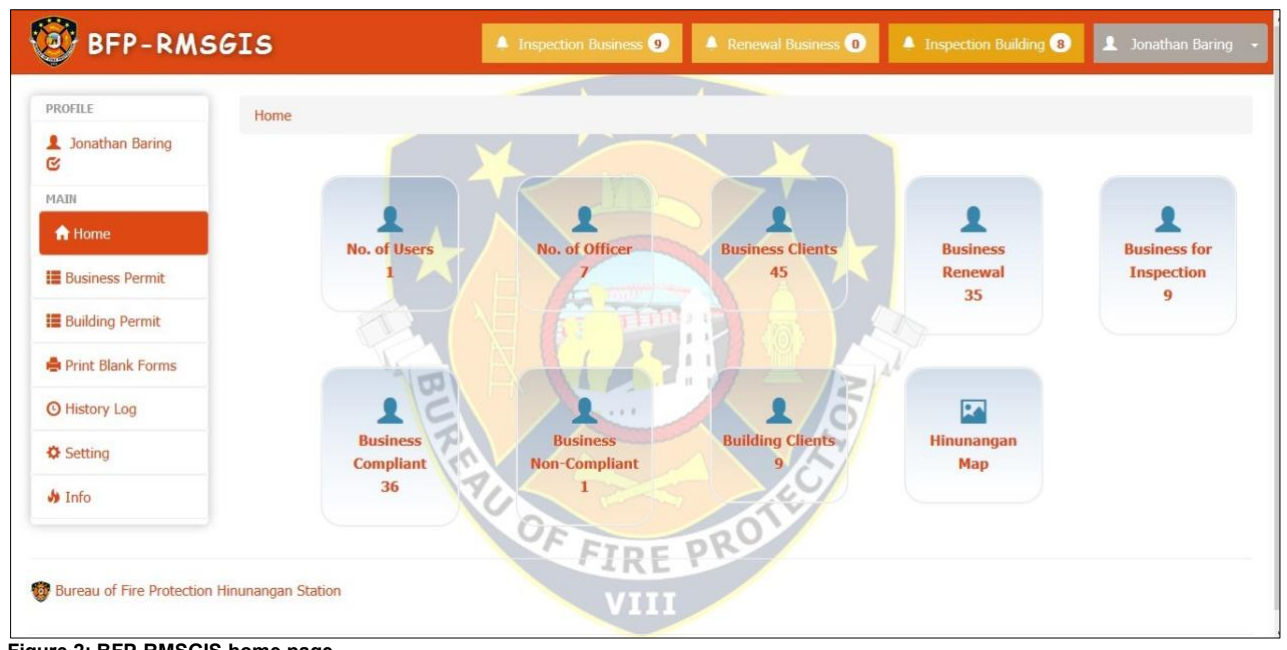
Figure 2: BFP-RMSGIS home page